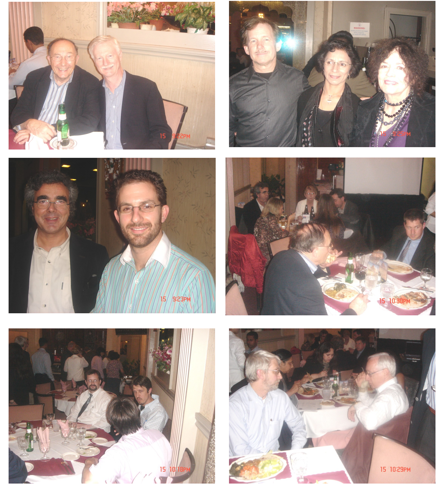
Members of IDARS and guests at the dinner party during the Society for Neuroscience meeting in November 2008.