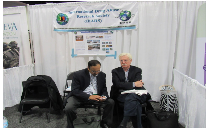
Selected pictures above are attendees of SFN meeting in 2017 in Washington DC at the IDARS booth. Pictures highlight presentation of IDARS to SFN members who are interested in joining IDARS.