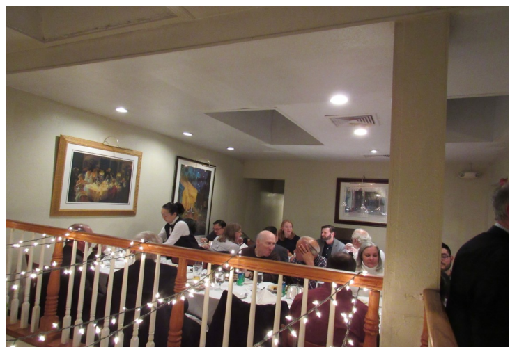
Members of IDARS, and their guests during the SFN meeting in Washington DC in 2017.