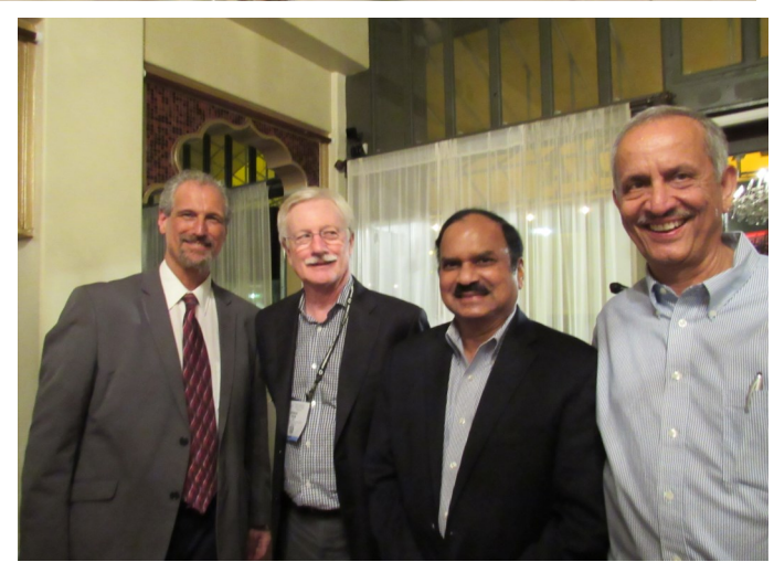
Members of IDARS and their guests at the IDARS social event as describe earlier during the society for neuroscience meeting in San Diego in 2016.